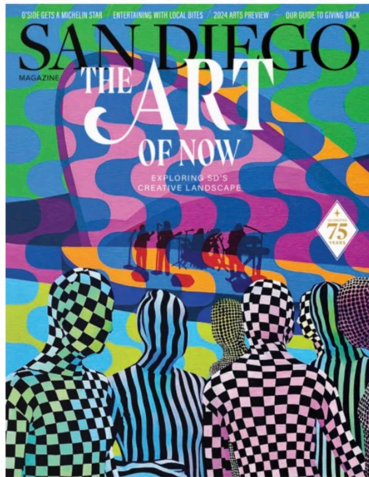
SONIC SHIFT